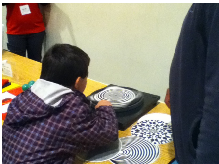
I'm getting dizzy!